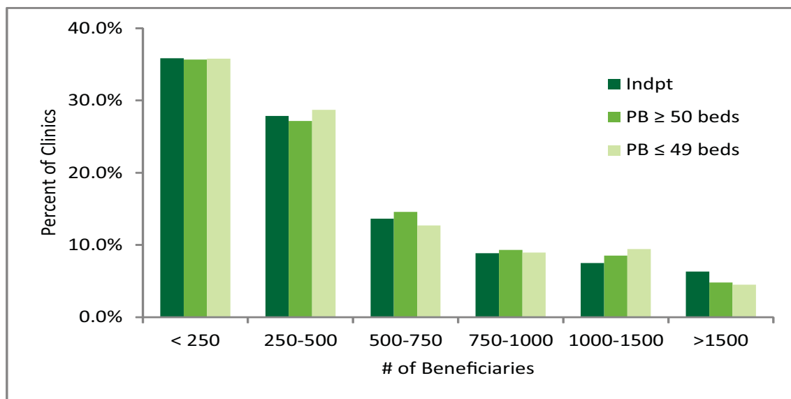
Figure 1: The number of distinct beneficiaries varies across RHCs, but is similar across RHC types

Note: Distribution is not statistically different by RHC type.