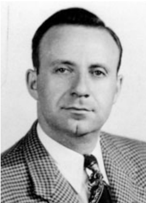
Assistant Professor of Public Health, 1947

I notice that during the early and middle 1950s, some of his titles began to sound less like scholarship and research and more like mild exhortations or at least wise musings, which suggests that they were probably speeches edited for publication—for example, “Community Hospital: The Future Health Center” and “We Must Use Hospitals More Effectively.”