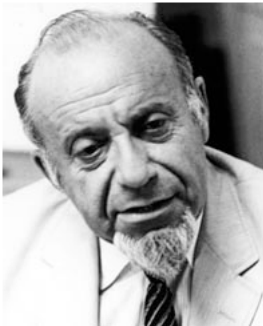
Vice Chancellor, mid-1970s